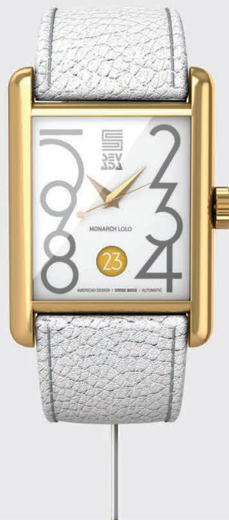
SVD MONARCH LOLO GOLD / WHITE DIAL / WHITE LEATHER BAND SWISS AUTOMATIC MOVEMENT ETA2671 WATERPROOF 50M