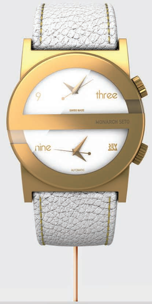
SVD MONARCH SETO GOLD / WHITE DIAL / WHITE LEATHER BAND SWISS AUTOMATIC MOVEMENT ETA2836 WATERPROOF 50M