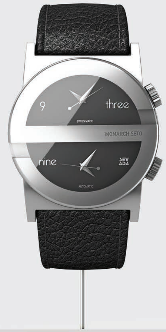
SVD MONARCH SETO SILVER / BLACK DIAL / BLACK LEATHER BAND SWISS AUTOMATIC MOVEMENT ETA2836 WATERPROOF 50M