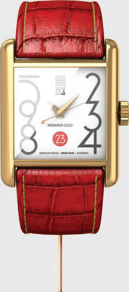
SVD MONARCH COCO GOLD / WHITE DIAL / RED LEATHER BAND SWISS AUTOMATIC MOVEMENT ETA2836 WATERPROOF 50M