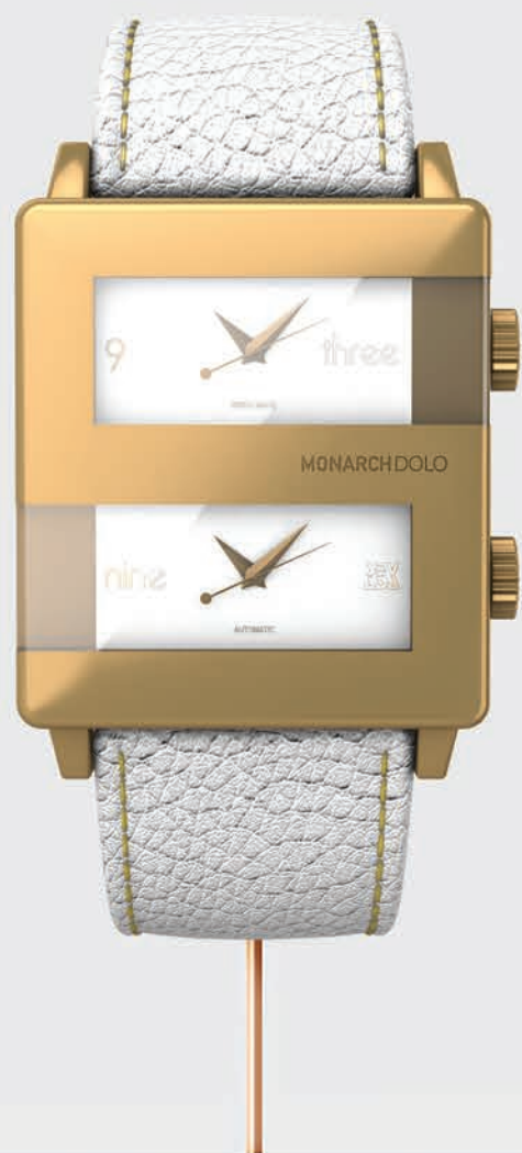
SVD MONARCH DOLO GOLD / WHITE DIAL / WHITE LEATHER BAND SWISS AUTOMATIC MOVEMENT ETA2836 WATERPROOF 50M