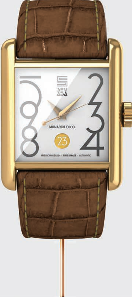
SVD MONARCH COCO GOLD / WHITE DIAL / BROWN LEATHER BAND SWISS AUTOMATIC MOVEMENT ETA2836 WATERPROOF 50M