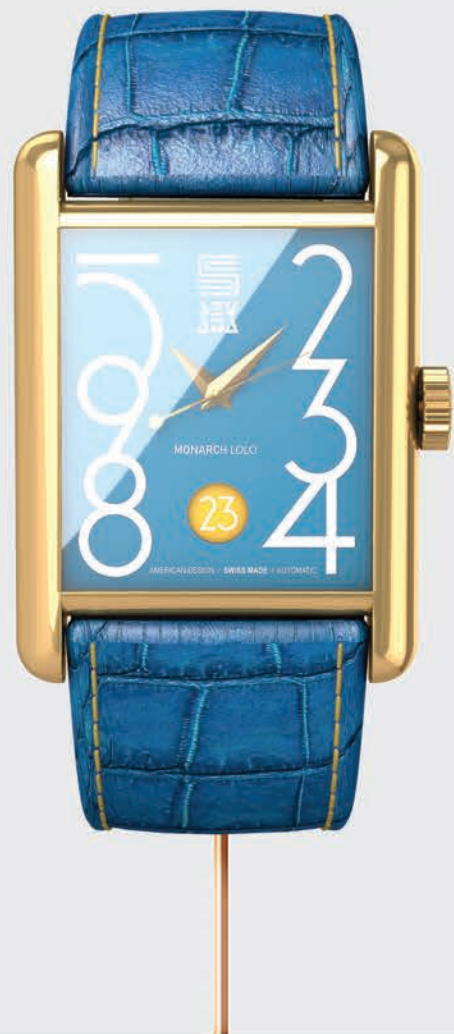
SVD MONARCH LOLO GOLD / BLUE DIAL / BLUE LEATHER BAND SWISS AUTOMATIC MOVEMENT ETA2671 WATERPROOF 50M