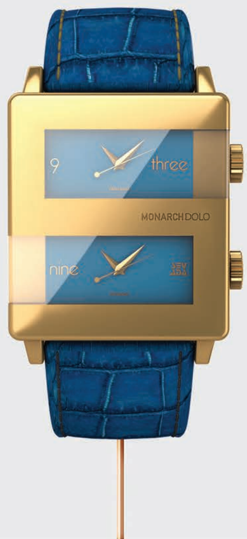
SVD MONARCH DOLO GOLD / BLUE DIAL / BLUE LEATHER BAND SWISS AUTOMATIC MOVEMENT ETA2836 WATERPROOF 50M