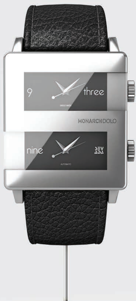
SVD MONARCH DOLO SILVER / BLACK DIAL / BLACK LEATHER BAND SWISS AUTOMATIC MOVEMENT ETA2836 WATERPROOF 50M