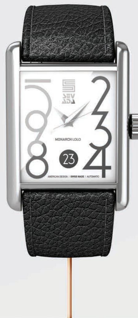
SVD MONARCH LOLO SILVER / WHITE DIAL / BLACK LEATHER BAND SWISS AUTOMATIC MOVEMENT ETA2671 WATERPROOF 50M