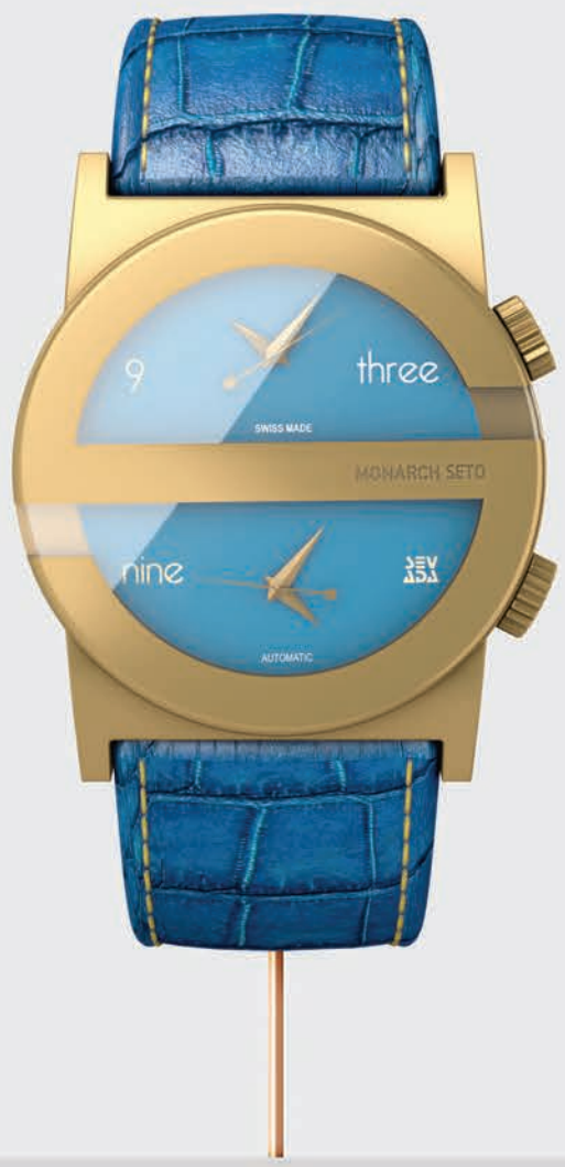
SVD MONARCH SETO GOLD / BLUE DIAL / BLUE LEATHER BAND SWISS AUTOMATIC MOVEMENT ETA2836 WATERPROOF 50M