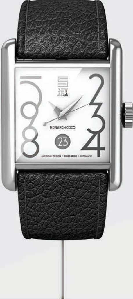
SVD MONARCH COCO SILVER / WHITE DIAL / BLACK LEATHER BAND SWISS AUTOMATIC MOVEMENT ETA2836 WATERPROOF 50M